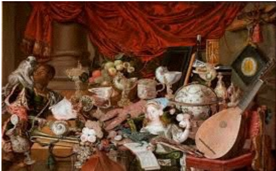
Paston's Treasure – circa 1690