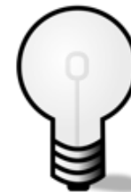
...a light bulb...