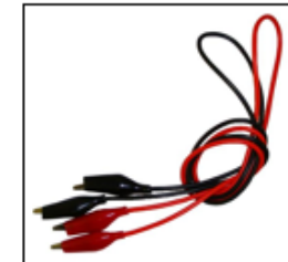
...electrical wires and crocodile clips.

Some materials do not allow electricity to pass through them. These materials are known as electrical insulators.