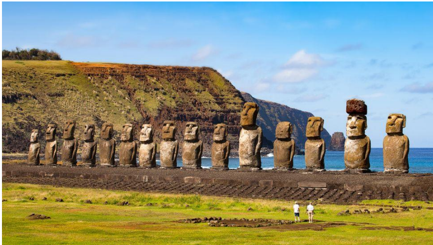
The Moai of Rapa Nui (Easter Island)